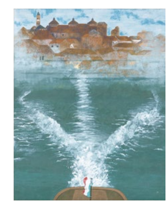
Matsuo Toshio: Good Bye, Venice (2013)