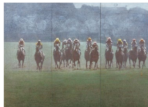
Miyasako Masaaki: Phase Space (2017)