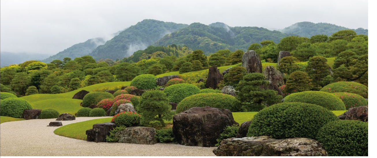
The Dry Landscape Garden in Spring

illusion as if you entered into a living canvas. The expansive Japanese gardens covering 165,000 square meters and Japanese paintings by Yokoyama Taikan and other painters make for excellent harmony. Here flows the time of "ease," in which you may feel like your heart is purified.