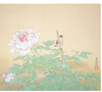
Sakakibara Shiho: Peonies (c.1938)