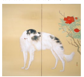
Hashimoto Kansetsu: Dogs from Europe (Right Screen c.1941)