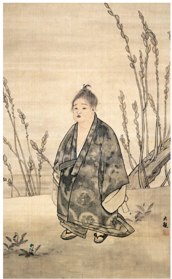
Yokoyama Taikan: Selflessness (1897)