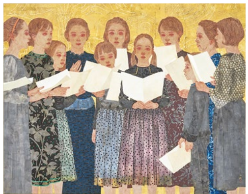
Miyakita Chiori: Calm Prayer (2019)