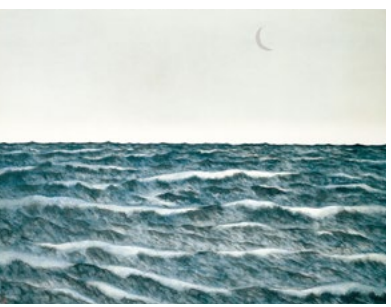
Yokoyama Taikan: Winter: Four Seasons of the sea (1940)