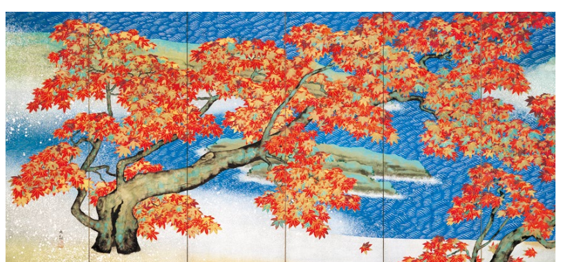
Yokoyama Taikan: Autumn Leaves (Left Screen 1931)