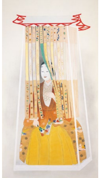
Kobayashi Kokei: Yang Guifei (1951)