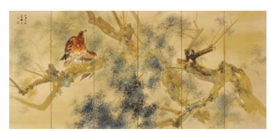
Takeuchi Seiho: After a Shower (Left Screen 1928)