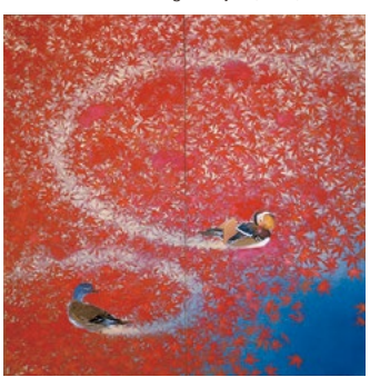
Kawabata Ryushi: Passion (1934)